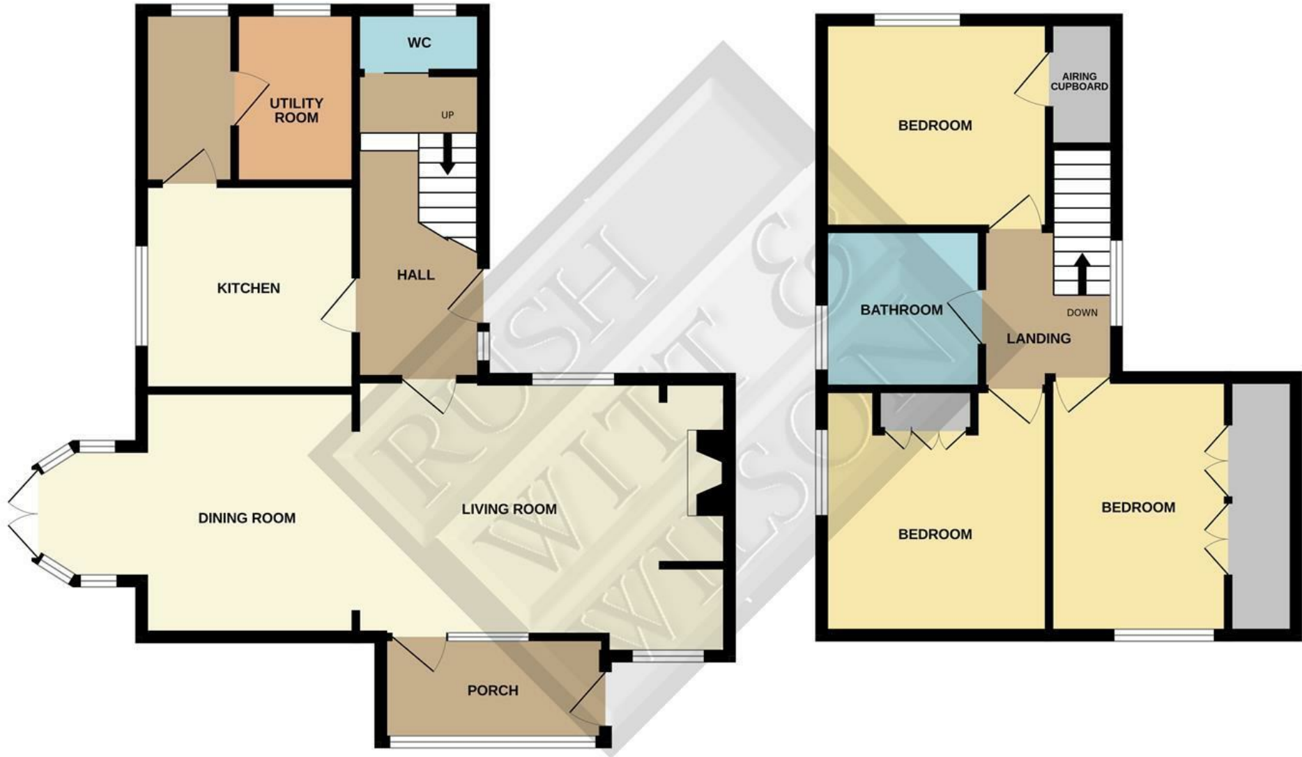
1ST FLOOR 488 sq.ft. (45.4 sq.m.) approx.

TOTAL FLOOR AREA : 1161 sq.ft. (107.8 sq.m.) approx.